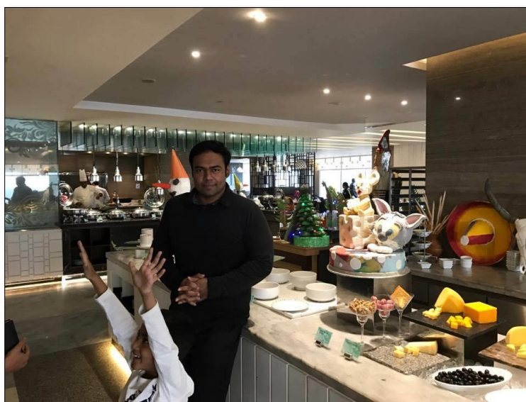
Figure 2. The Author.